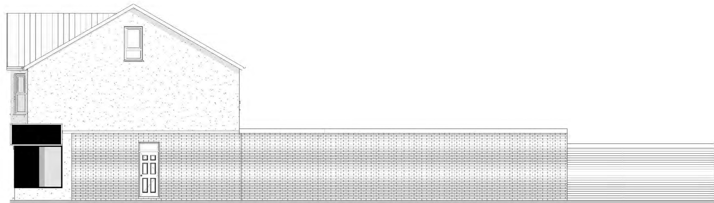
2 Existing Elevation - North 1 : 100