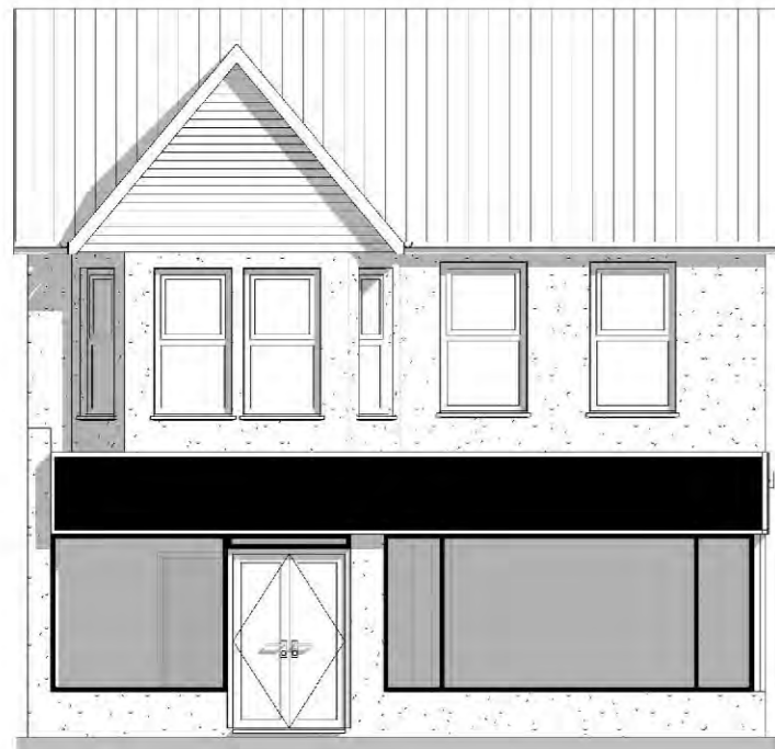
1 Existing Elevation - East 1 : 100